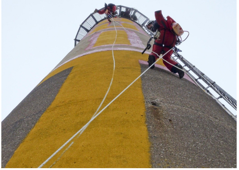
Greenpeace activists scale the Fisk smokestack.

It was dark and chilly before dawn as Kelly Mitchell and seven other Greenpeace activists stood gazing up at the smokestack of the Fisk plant, its plume reflecting the yellowish night lights of the city. The group made their way surreptitiously onto the Fisk property, silent and careful as cats. They headed straight for the stack, and began to climb it. With a cold wind blowing, one by one they ascended a small maintenance ladder of metal rungs welded to the side, staying calm and determined as they reached dizzying heights.