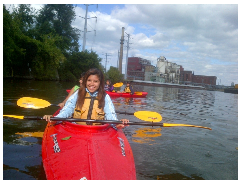
LVEJO members kayak past the Fisk power plant.

While the Fisk and Crawford closings made national headlines, in March 2012 the State Line coal plant owned by Dominion Resources also shut down, with little fanfare.<sup>1</sup> Residents of Chicago's Southeast Side had learned much about the impacts of coal during their fight against a proposed coal gasification plant in their neighborhood. Governor Pat Quinn had vetoed a bill considered crucial for the company Leucadia National Corp. to open the plant, which would have turned coal and petroleum coke into synthetic natural gas for cooking and heating.<sup>2</sup>